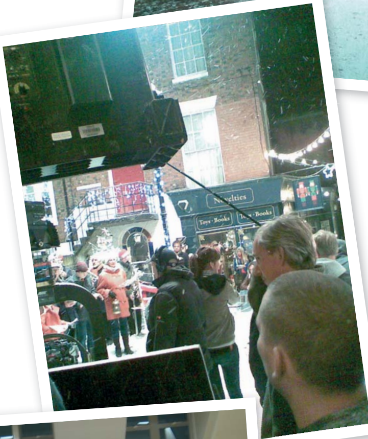
Fans clamouring for autographs