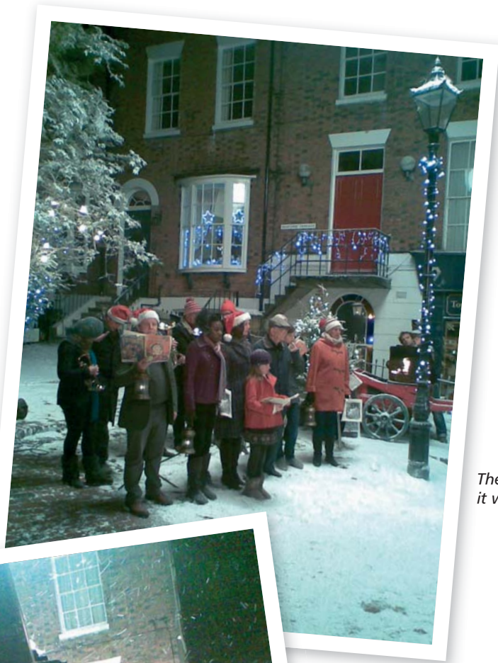
The Met Office gets it wrong AGAIN!